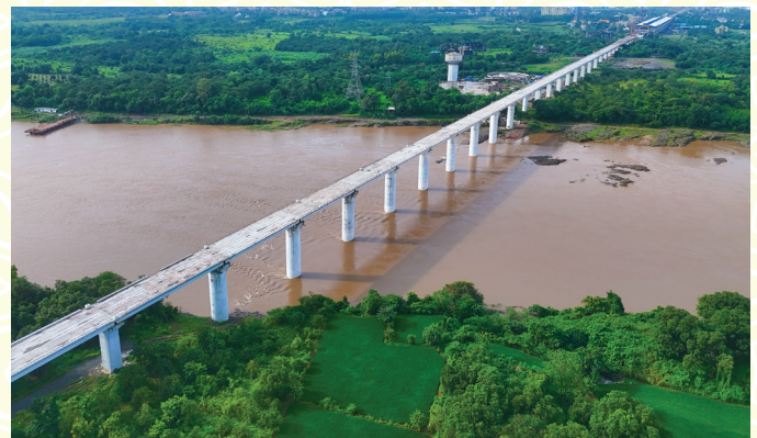
Bridge on Daman Ganga River, Valsad District

In addition, 25 bridges are being constructed on rivers as part of the alignment, of which 21 bridges are located in the state of Gujarat and 4 bridges in the state of Maharashtra.