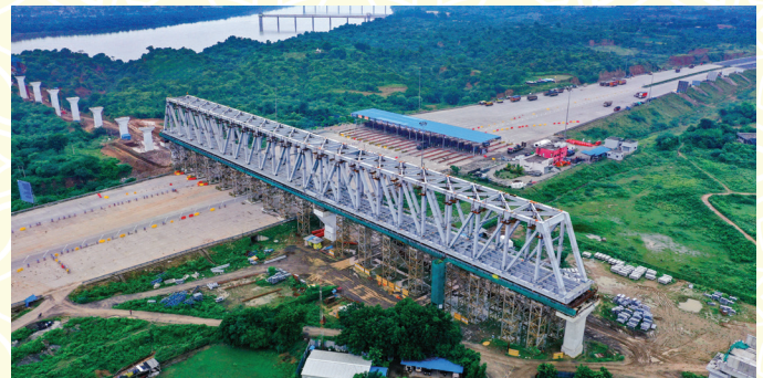
230 m long 'Make in India' Steel Bridge over Delhi-Mumbai National Expressway near Vadodara

spanning over National and State Highways, Irrigation Canals, River and Railway tracks etc.