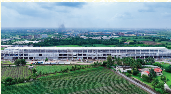
Under Construction Surat Bullet Train Station

The design of each of the 12 stations on the MAHSR line will reflect the spirit of the city it is located in. This will bring about an instant connection with the local populace, and promote a sense of ownership of the high-speed rail system. The stations are being designed with contemporary architectural facade and state-of-the-art modern finishes.